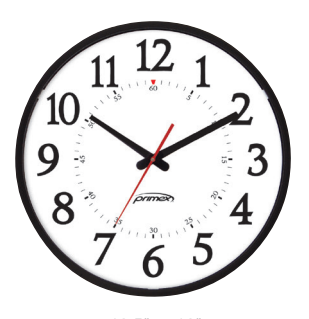
12.5" or 16" Traditional Series