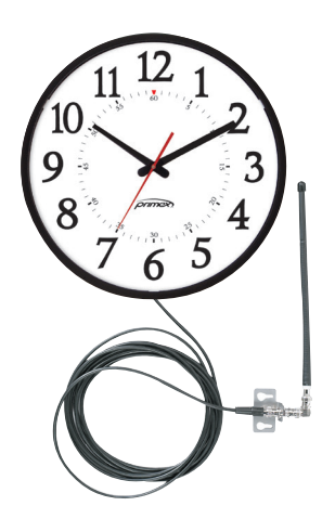
Remote Antenna Clock