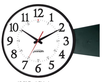
12.5" Dual-Sided Traditional Series