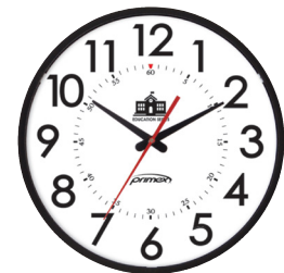
12.5" or 16" Traditional Series