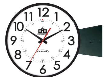
Easy-to-assemble bracket kit lets you create a dual-sided clock for hallways or other large areas.